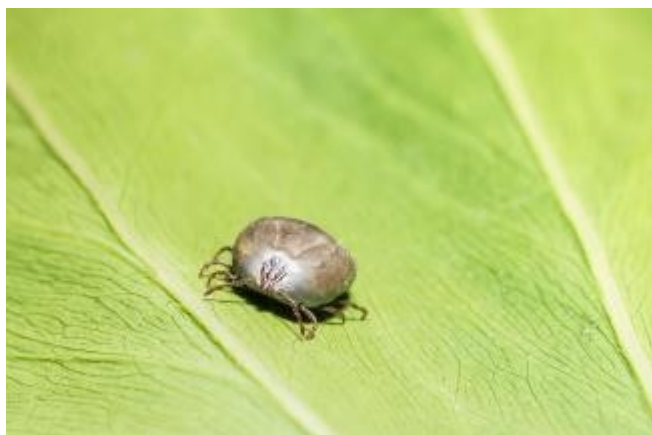
The Haemaphysalis longicornis tick can carry the virus that causes severe fever with thrombocytopenia syndrome (SFTS).

Thank you to Carole Raschella for submitting this.