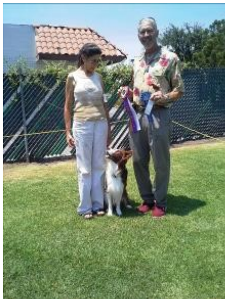
7-23—AM Trial—CD title, and High in Trail

These outdoor trials were either a testament to dedication or to insanity! Somehow extreme conditions seemed to bring out the best in everyone. We shared shade, stewarding, watermelon, ice packs, and yes . . . cheer!