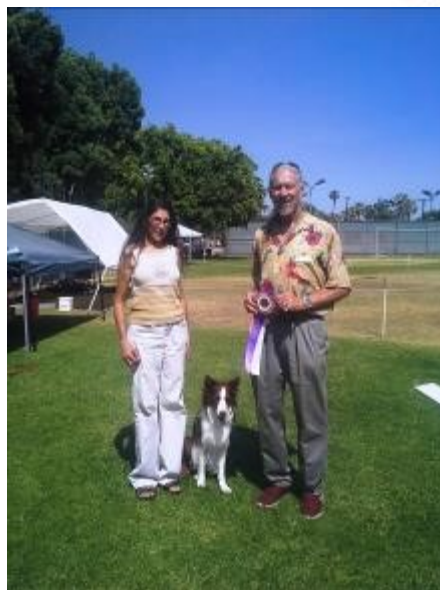
7-23 PM Trial—1st CDX Leg, and High in Trial